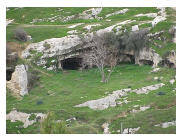
Ancient tomb caves in the Himmon Valley

The name gehenna is not only a reference to the place of final punishment but a figure drawn from the valley outside the gates of Jerusalem. In modern times, the Hinnom Valley holds the ruins of ancient tombs and some of it is filled with run-down older homes. It is clear that in New Testament times this was a place of fire, ashes, uncleanness, and (at times) dead bodies. It sat outside the gate known as "the dung gate" (Neh. 3:13-14; 12:31). The Old City gate fortified by Suleiman in 1538 that stands near the same location still bears this name. Commentators have probably gone too far in painting a picture of the valley as a virtual burning "landfill." While that picture cannot be documented, it is clear that