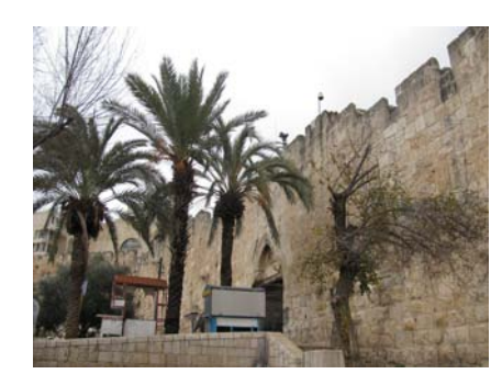
The "Dung Gate" in the Old City

inference confirming that in His own day the Hinnom Valley was a place of filth and fire. This is what allowed it in the first century and beyond to serve as a suitable figure of eternal punishment in fire.