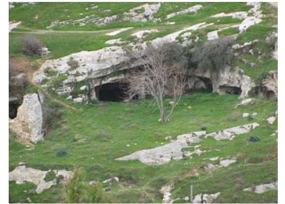
Ancient tomb caves in the Hinnom Valley

The name gehenna is not only a reference to the place of final punishment but a figure drawn from the valley outside the gates of Jerusalem. In modern times, the Hinnom Valley holds the ruins of ancient tombs and some of it is filled with run-down older homes. It is clear that in New Testament times this was a place of fire, ashes, uncleanness, and (at times) dead bodies. It sat outside the gate known as “the dung gate” (Neh. 3:13-14; 12:31). The Old City gate fortified by Suleiman in 1538 that stands near the same location still bears this name. Commentators have probably gone too far in painting a picture of the valley as a virtual burning “landfill.” While that picture cannot be documented, it is clear that