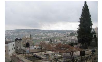
Old homes in the Hinnom Valley

In the days of kings of Judah, the Hinnom Valley was the site of pagan idolatry where children were burned in sacrifice to idols (2 Chron. 28:3; 33:6; Jer. 32:35). During the reign of Josiah, he put this practice to an end when "he defiled Topheth, which is in the Valley of the Son of Hinnom, that no man might make his son or his daughter pass through the fire to Molech" (2 Kings 23:10, NKJV). Part of this defilement probably involved spreading the burned