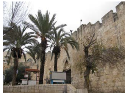
The "Dung Gate" in the Old City

4700 Andrews Ave. Amarillo TX 79106 806-352-2809 www.olsenpark.com