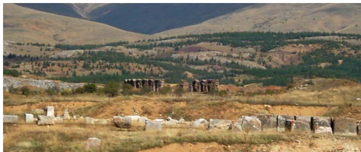
Ruins of Pisidian Antioch

In Acts 13:38-46 we read about Paul and Barnabas' work in Pisidian Antioch. After some of the Jews began to oppose them Paul describes the people as having judged "themselves unworthy of eternal life" (Acts 13:46). This doesn't mean that they didn't want eternal life. Everyone wants eternal life (if they recognize the need for it), but they didn't recognize that Paul offered the only means to eternal life. The gospel of Jesus Christ is the only true way to eternal life (Acts 4:9-12).