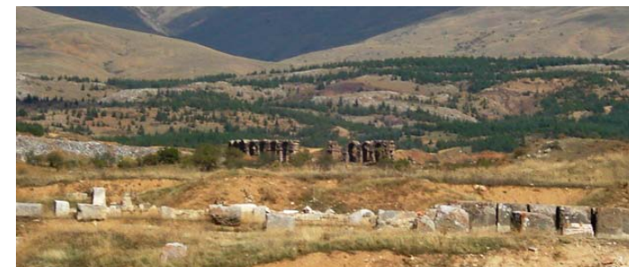
Ruins of Pisidian Antioch

In Acts 13:38-46 we read about Paul and Barnabas' work in Pisidian Antioch. After some of the Jews began to oppose them Paul describes the people as having judged "themselves unworthy of eternal life" (Acts 13:46). This doesn't mean that they didn't want eternal life. Everyone wants eternal life (if they recognize the need for it), but they didn't recognize that Paul offered the only means to eternal life. The gospel of Jesus Christ is the only true way to eternal life (Acts 4:9-12).