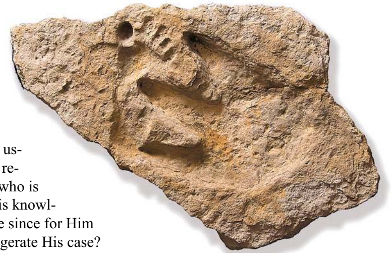
Dinosaur and human footprints from Glen Rose Texas

So is there any extra-biblical evidence that would support claims of dinosaurs coexisting with